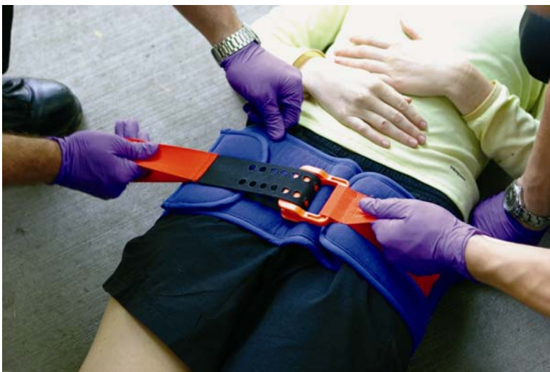
Figure 1: Sling Applied by Two People

The results of the laboratory and clinical study and experience with use over time suggest the PCCD can rapidly reduce and stabilize open-book pelvic ring fractures. The PCCD has not caused complications when applied to a range of pelvic ring injuries, including internal rotation injuries that are prone to internal collapse. The PCCD can be applied by EMS providers, (EMT and above) at the accident scene for early and effective stabilization before, and during, transport, or by physicians in the ED.